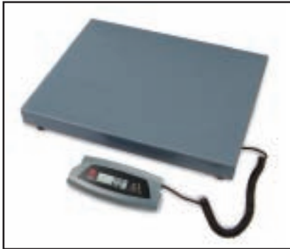
165lb and 440lb models available with large platform