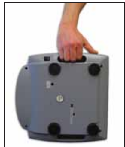
Integrated handles in the housing allow easy transport of the EC Scale