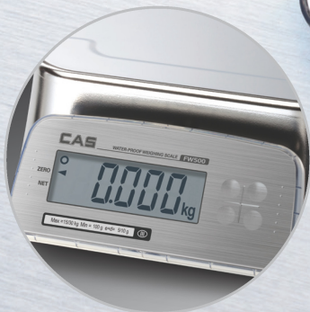
^ Rear display