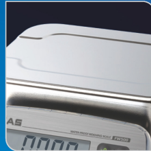
Stainless Steel Tray